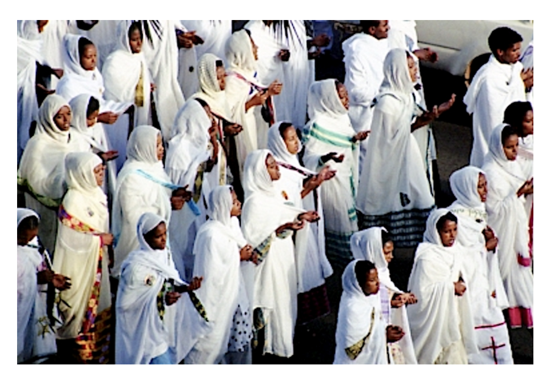
Religious Procession - Asmara (Oct 2000)

Support for the Arts. Since the Eritrean society is extremely poor, the government needs to prioritize its funds for development efforts, leaving little for the arts. However, some support is given to cultural shows and exhibits that portray the cultural variety of the Eritrean people. Support is also given to exhibits and shows that display the hardships and sacrifices of the thirty-year war of liberation.