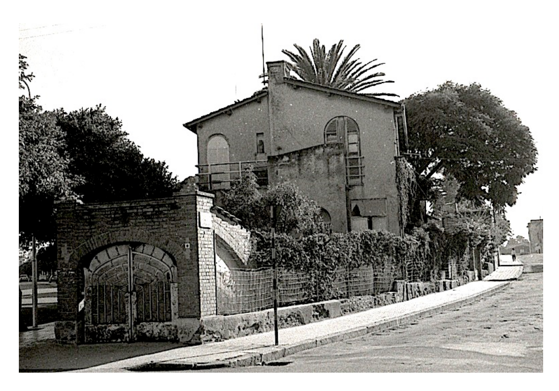
Asmara City (Oct 2000)